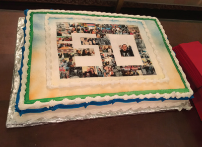
The fabulous 50th anniversary cake created and donated by the Cake Gallery