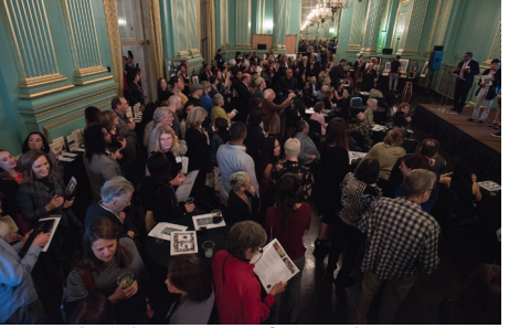
Friends and supporters of Hospitality House